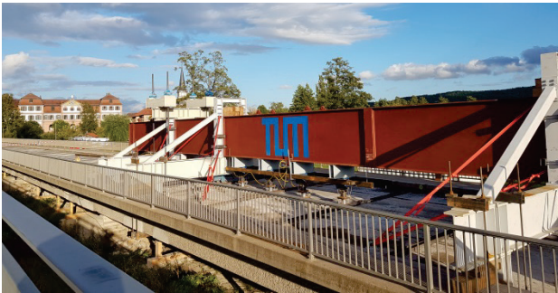
Fig. 2: Reaction girder with reinforcement frames

To realise the planned loading concept, a 31.65 m reaction girder was designed and mounted above the bridge (please refer to Fig. 2). By means of this girder, it was possible to introduce the necessary loads via six hydraulic cylinders (see Fig. 3). Due to the unfavourable ground conditions and the repeated use of the loading equipment in several positions on the bridge, the steel girder was temporarily fixed to the bridge piers via massive steel rods and crossbeams. To carry out five tests in five different positions on the bridge (as shown in Fig. 1), the whole system was also designed to be moveable by using hydraulic pushing cylinders, as well as heavy-duty rollers, rails and sliding plates.