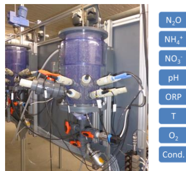
Fig. 2: Lab-scale reactor systems for process investigations

For lab-scale studies six PLC controlled reactor systems have been set up in the „Technikum“ of the institute of Urban Water Systems Engineering (Fig. 2) equipped with in-situ online monitoring devices for all relevant parameters